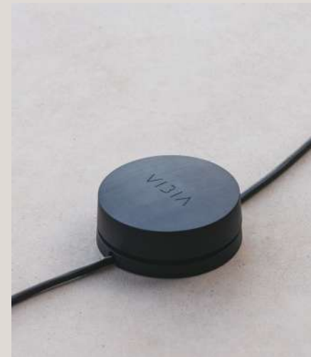
Floor switch ref. 7480, 7485, 7487.